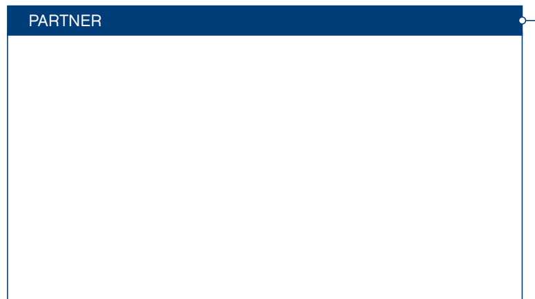
ES-A_200_205_210_fa3_US_010609; effective June 1 st 2009

Due to continuous innovation, research and product improvement, the specifications in this product information sheet are subject to change without notice. No rights can be derived from this product information sheet and Evergreen Solar assumes no liability whatsoever connected to or resulting from the use of any information contained herein.